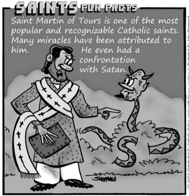
"Show me your wounds if you are truly Jesus!"

(excerpts from www.mycatholic.life/saints )